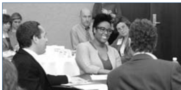
Faculty members and hiring committee members from dozens of universities and institutions brought their ideas to the table at the five IWiN workshops held across the country.

The IWiN workshops were developed in 2010 as part of NSF's ADVANCE program, aimed at "increasing the representation