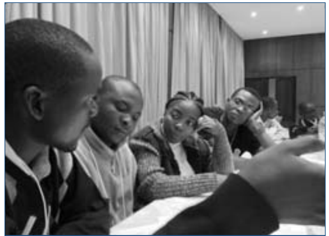
Neuroscience instructors participate in the 6th Teaching Tools Workshop in Rabat, Morocco, sponsored by SfN and African Regional Committee of IBRO.

Because of the diversity of students and courses, the workshop focused on training instructors how to teach students the basic elements of neuroscience: fundamentals of neurons and glia, principles of electrophysiology, selected aspects of sensory and motor processing and function, and