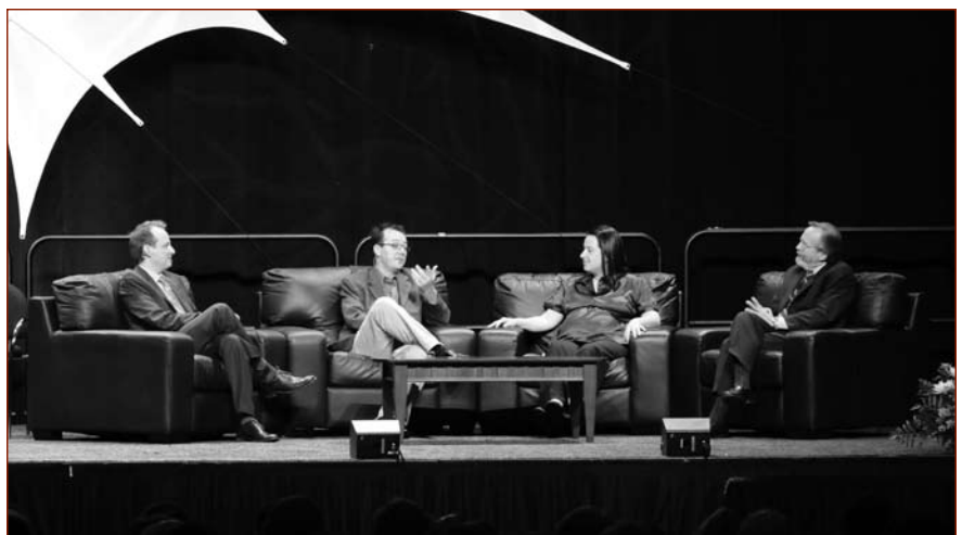
During the Dialogues Between Neuroscience and Society presentation, magicians and neuroscientists explored the science behind magic, including what happens to the brain during attention manipulation.

Collins focused on the research community's responsibility to communicate the scientific and health impact of grants funded through ARRA. Collins urged recipients of recovery dollars to communicate how research funding supports the community and why it is a positive national investment. Collins also highlighted the SfN Recovery Act Impact Form as an important tool for recording and educating lawmakers on the economic impact of funding for NIH research.