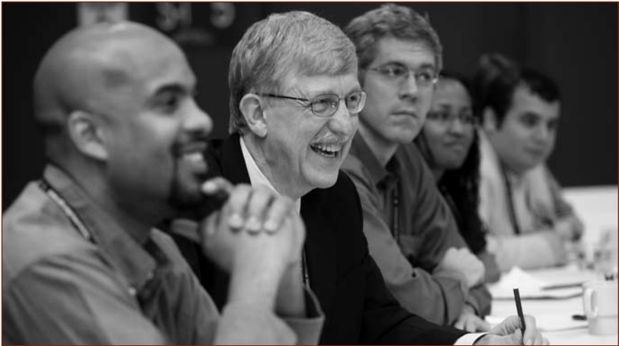
Prior to his presentation, NIH Director Francis Collins met with postdoctoral fellows to discuss challenges facing research, institutions, and scientific careers.