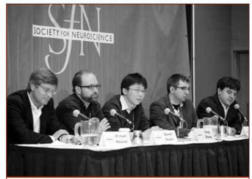
Researchers described new applications for optogenetics during a press conference at Neuroscience 2009.

Inside Science is a new series featuring emerging research across the field, reflecting SfN's commitment to showcasing great science. In each issue, Inside Science explores topics highlighted by press conferences at SfN's annual meeting. Press conference topics were selected by SfN volunteer leadership, with input from the Program Committee on exceptional meeting abstracts.