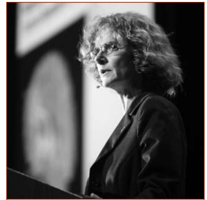
Nora Volkow, director of the National Institute of Drug Abuse, explored how neuroimaging technologies and behavioral research have improved knowledge of changes in the brain caused by addiction.

In a special presentation, National Institutes of Health (NIH) Director Francis Collins discussed his vision for NIH, and the key challenges and opportunities facing NIH and the broader scientific community. Collins highlighted the increases to NIH funding from the 2009 Congressional stimulus package, while placing a strong emphasis on the importance of participating in scientific and public policy that encourages basic, translational, and clinical research. Watch the video at www.sfn.org/amhighlights .