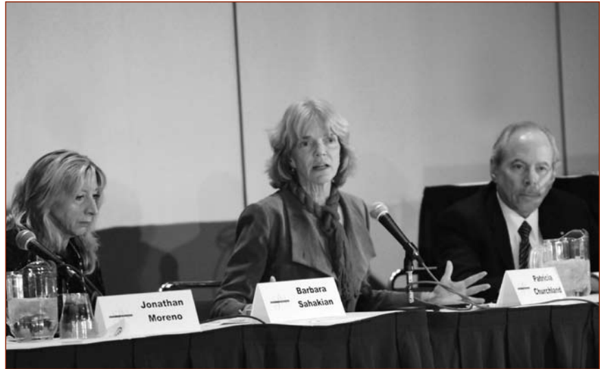
Presenters focused on how the scientific community can engage the public to find common ground between science and society during the Social Issues Roundtable.

Contact Neuroscience 2009 exhibitors offering products and services through My EXPO, a virtual directory of Neuroscience 2009 vendors. My EXPO is searchable by exhibitor names, products, or keywords. Visit www.sfn.org/am2009/myexpo .