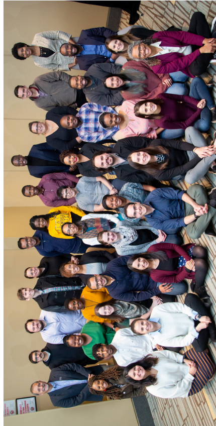
Fellows, Neuroscience 2019